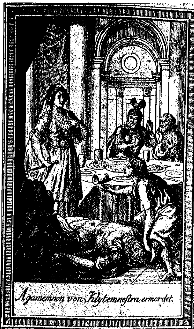
A copper engraving depicting the slaying of Agamemnon.